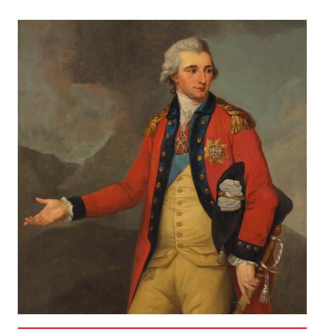
1. Portrait of Stanislaus Poniatowski after Angelica Kauffmann, Royal Castle in Warsaw – Museum, ACNO ZKW/1635

However, on the whole it can be said that the Prince, an art patron and an outstanding collector, has over the recent years proved more inspiring to the Italian circles than others. What the Italians find intriguing is the life story of the King's nephew who, following the sale of numerous large estates and real estate, filled his life in Italy with purchases of carefully selected estates, real estate and movables, including the highest-quality art pieces. Regrettably dispersed today, the collection pieces are now found in the most prestigious world museums.