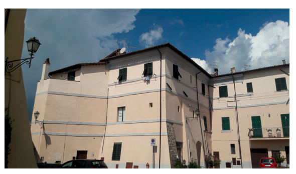
8. Palazzo Poniatowski as seen from the side of Piazza della Rocca – current state after destructions and remodelling, with several private flats inside