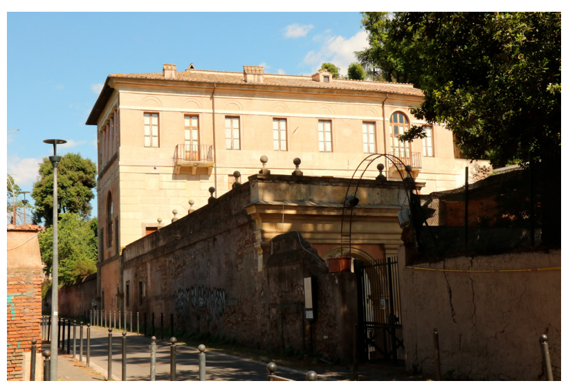
3 and 4. Villa Poniatowski, elevation from the side of di Villa Giulia Street, Villa Poniatowski, elevation from the side of di Villa Giulia Street

the Physical Society, active as of 1778, and following the fashion of the time, he would collect nature specimens, minerals included.<sup>32</sup> During his three-month trip to Germany in the summer of 1784, the Prince displayed much interest in art and studied it further. In Berlin and Leipzig, he visited painters' and sculptors' studios, as well as a porcelain manufacturer; furthermore, he debated over ancient art, and admired sculptures at Sans-Souci.33 In Leipzig, he made big purchases from antiquarians, which testified to the refined and stable taste of the Prince, aged 30 at the time, as well as to his substantial financial capacity, since he purchased a large painting by Van Dyck, a beautiful Rembrandt..., a precious drawing by Reynolds.34 Not only did Stanisław Poniatowski discover a golden vase offered in the 17<sup>th</sup> century by Smolensk to victorious King Sigismund III when visiting the Munich museum in the company of the philologist Mateusz Nielubowicz-Tukalski, but he also successfully endeavoured to have the historic item restored to the Polish King.35 Importantly, during that trip, apart from showing a vivid interest in old art, the Prince commissioned works from contemporary artists as well.36