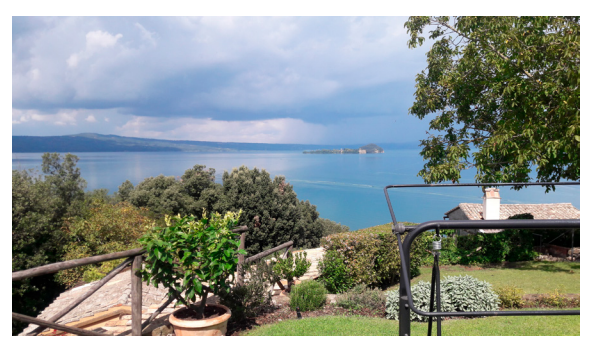
10 and 11. Palazzo Poniatowski, view of Lake Bolsena from the palace garden