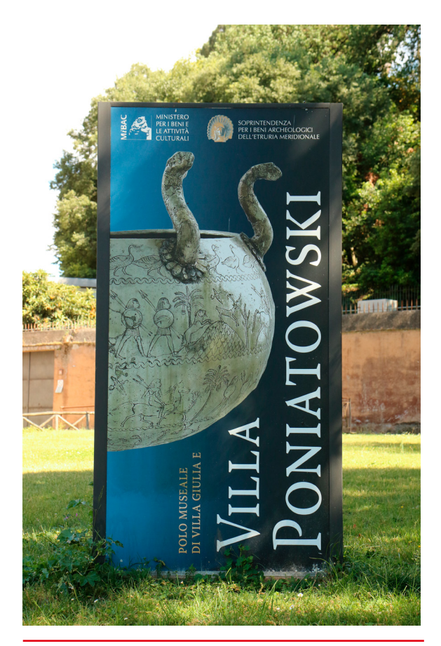
6. Villa Poniatowski, information on the Etruscan art collection

lover of antiquities was misled, the deception not going unnoticed by the observers of the scene: he purchased for the King an urn with ashes said to be those of Scipio Africanus which soon, however, turned out to be the ashes of sacrificial calves. <sup>40</sup> In the memoirs dictated by the end of his life, the Prince, who was first of all a practical individual and a keen observer, remarked: I made a trip to Italy, to Calabria and Sicily where I realized what that beautiful country could be, and which it was not. <sup>41</sup>