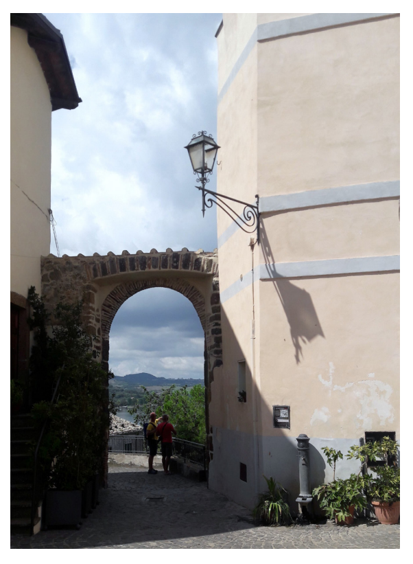
9. Palazzo Poniatowski, passage to the garden with the view of Lake Bolsena